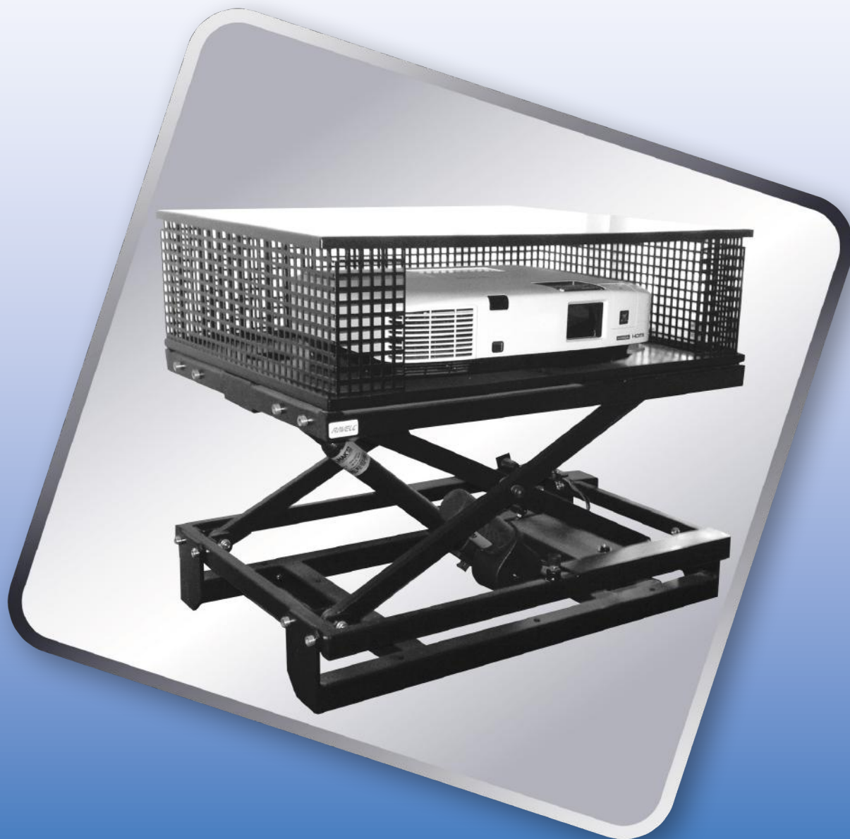
TABLE LIFT P-320

The RAVELL® FURNITURE / TABLE LIFT for the multimedia projector provides an excellent alternative to ceiling lifts. Enables you to install a multimedia projector in a piece of furniture or the floor.